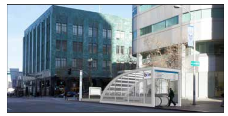
A new canopy over Oakland 19th St. Station opened in early 2015 with real time arrival information for approaching riders.

As BART ridership continues to surge, increasing capacity and fleet replacement must remain top priorities. But just as critical – over the longer term for the Bay Area – is re-investing in the system's state-of-good-repair and remaking and modernizing the entire BART system for the future. Along with the benefits that public transit naturally brings to a region, it only makes sense that a better BART will, in turn, help ensure a better Bay Area. Riders may notice a more accelerated effort to improve BART's decades-old stations, as BART works to implement long range visionary efforts that will improve its infrastructure.