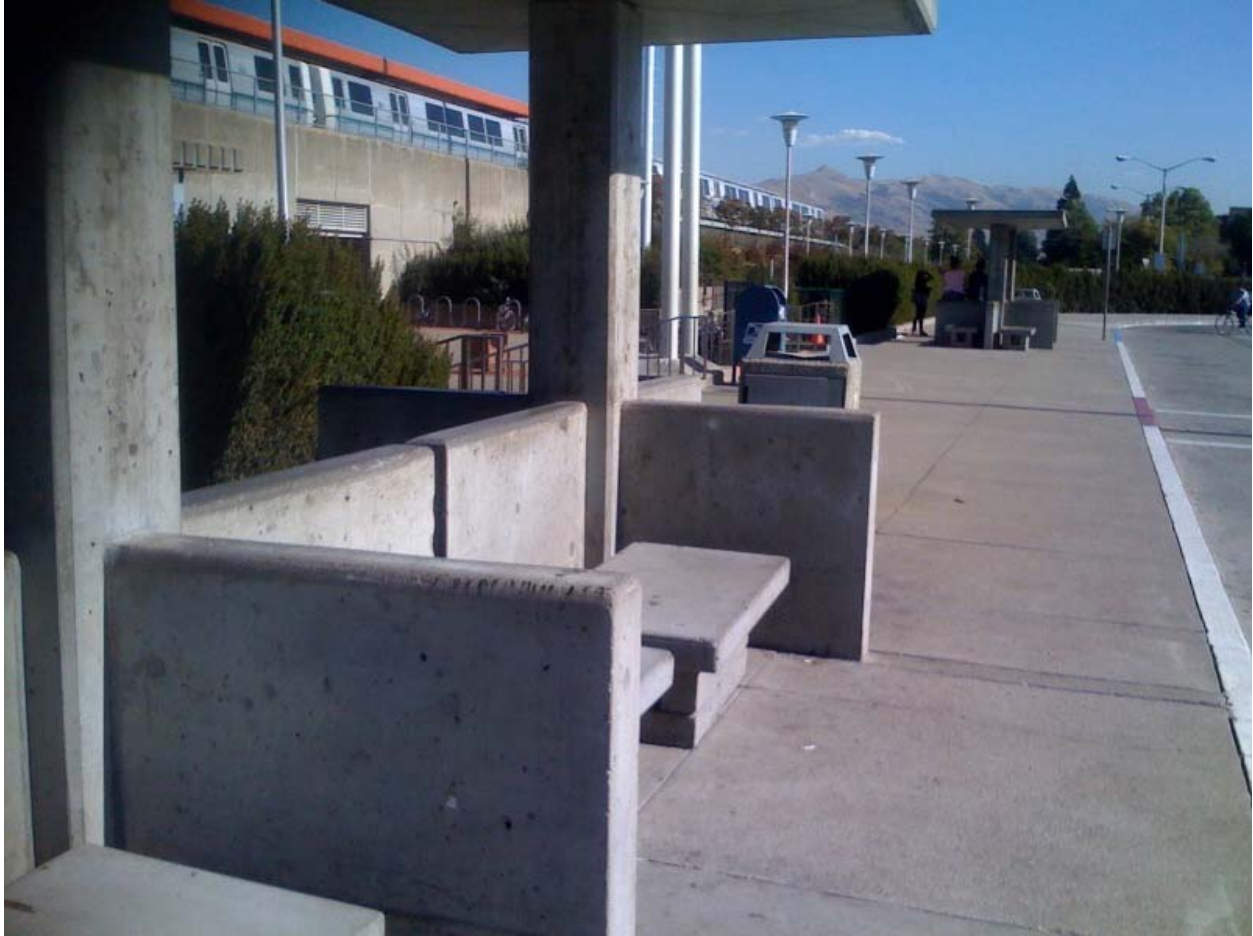
Figure 4: Fremont Station Seating Areas

This image shows a view of both of the seating areas identified to receive artwork