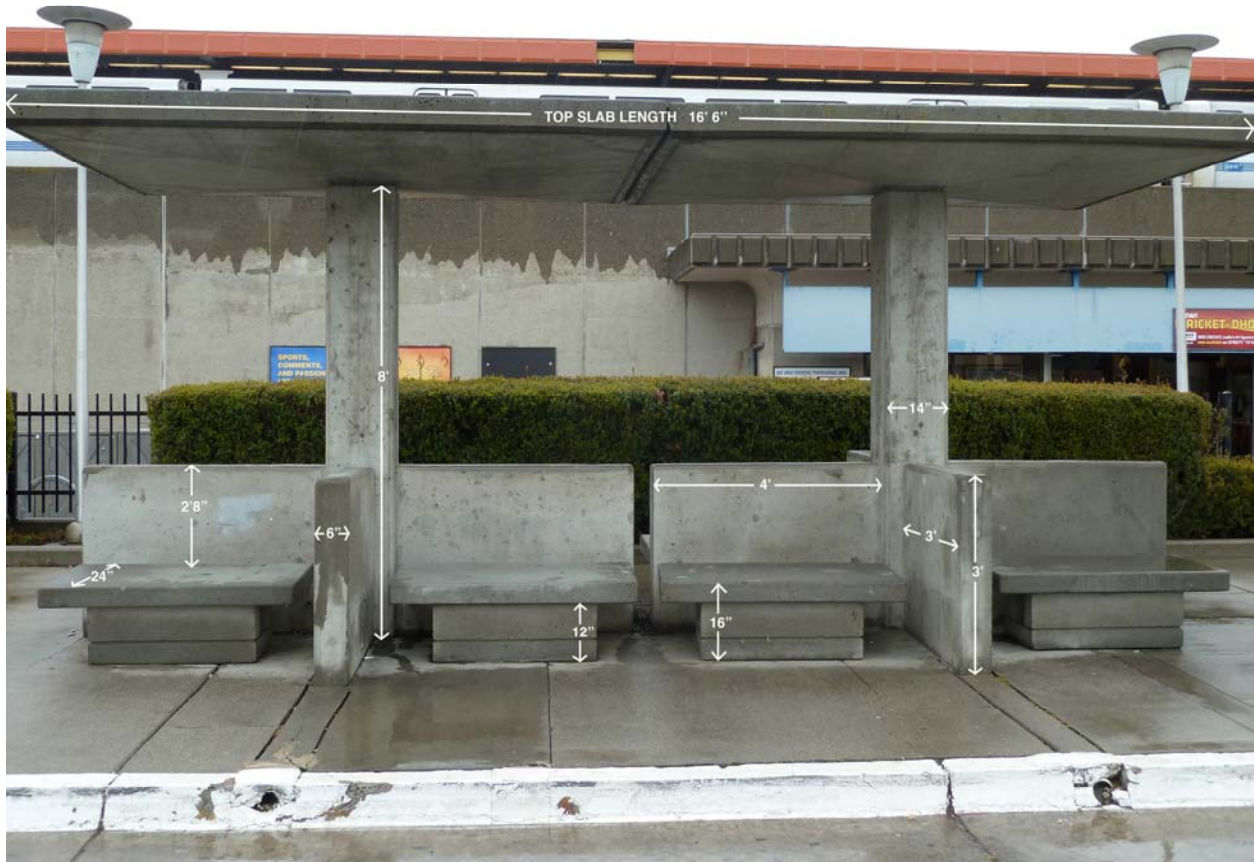
Figure 3: Fremont Station Seating Area

This image shows one of the two identical seating areas at the Fremont Station. Dimensions are approximate; commissioned artists will be required to take field dimensions.