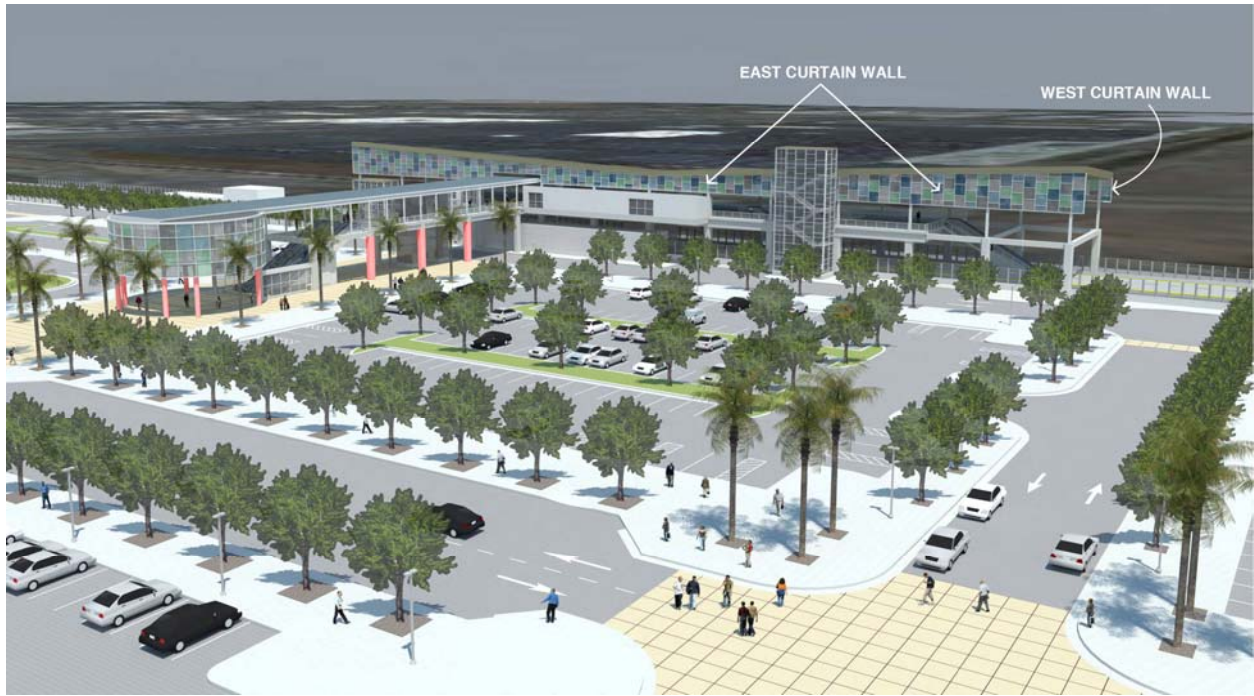
Figure 2: Station Overview with Pavilion and Concourse

This image shows four of the six columns that support the pavilion (as show in Figure 1 above), and three of the six columns that are under the north side of the pedestrian crossing. There are 3 identical columns on the south side of the pedestrian crossing.