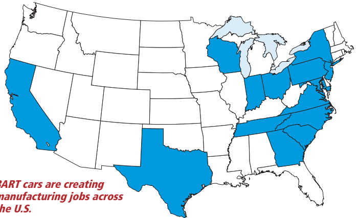
BART cars are creating manufacturing jobs across the U.S.

The $2.5 billion contract with Bombardier is BART's largest capital project to date and will support thousands of manufacturing jobs in California and across the country. Companies in the United States will be supplying many of the materials and parts used in the train cars, including the propulsion system, brakes, raw aluminum used for the body, and much of the electrical wiring. Final assembly of the new train cars is underway at Bombardier's manufacturing plant in Plattsburgh, New York. Locally, jobs have been and will be created to support the design, commissioning, warranty and other activities associated with the project.