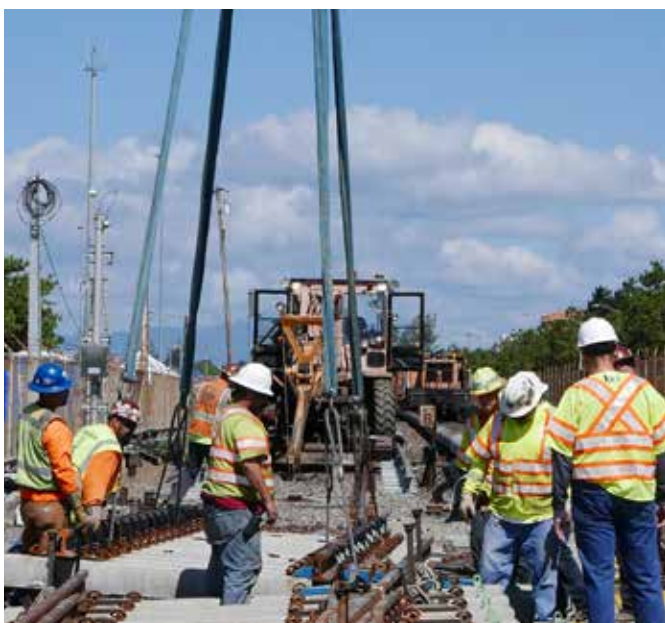
Workers conduct track repair and upgrades in downtown Oakland.

We’re rebuilding and reinvesting, with projects spanning every part of the region.