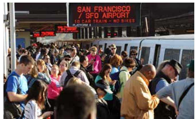
BART ridership has been increasing and exceeds capacity today.