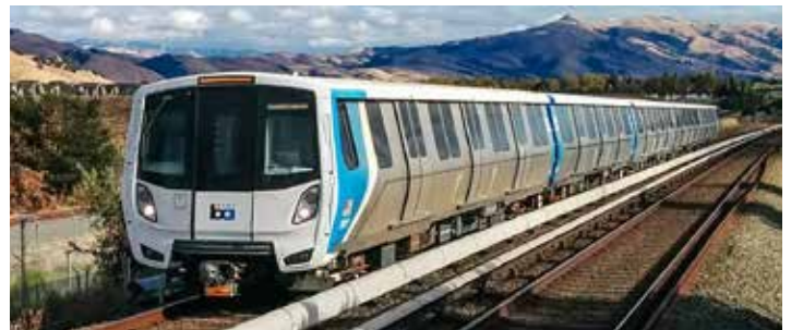
*Source: American Public Transportation Association 2016 Public Transportation Fact Book.

Over the next year, production will ramp up to a rate of 16-20 new cars per month. The balance of new train cars is scheduled to be delivered before the end of 2022.